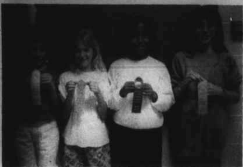
U.I.L. District winners